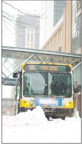
Bus waiting areas should be kept clear of snow and ice.

Redesigning urban landscapes for all seasons is often a challenge, especially for cities which experience months of cold, dark, and snow. Too often, urban environments reinforce the cold weather by funneling wind down streets lined with gray stone or steel buildings. Luckily, by following a few simple design guidelines, it is possible to make urban spaces just as vibrant and inviting in winter as they are in other seasons.