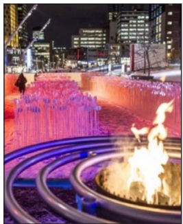
Color, light, and fire can make a space much more appealing in winter.

The Metro Transit TOD Office hosted a TOD Forum on Winter Cities in February 2017. A full-length video, presentation slides, and the City of Edmonton's Winter Design Guidelines are available for more detail on how to create a great four-season city.