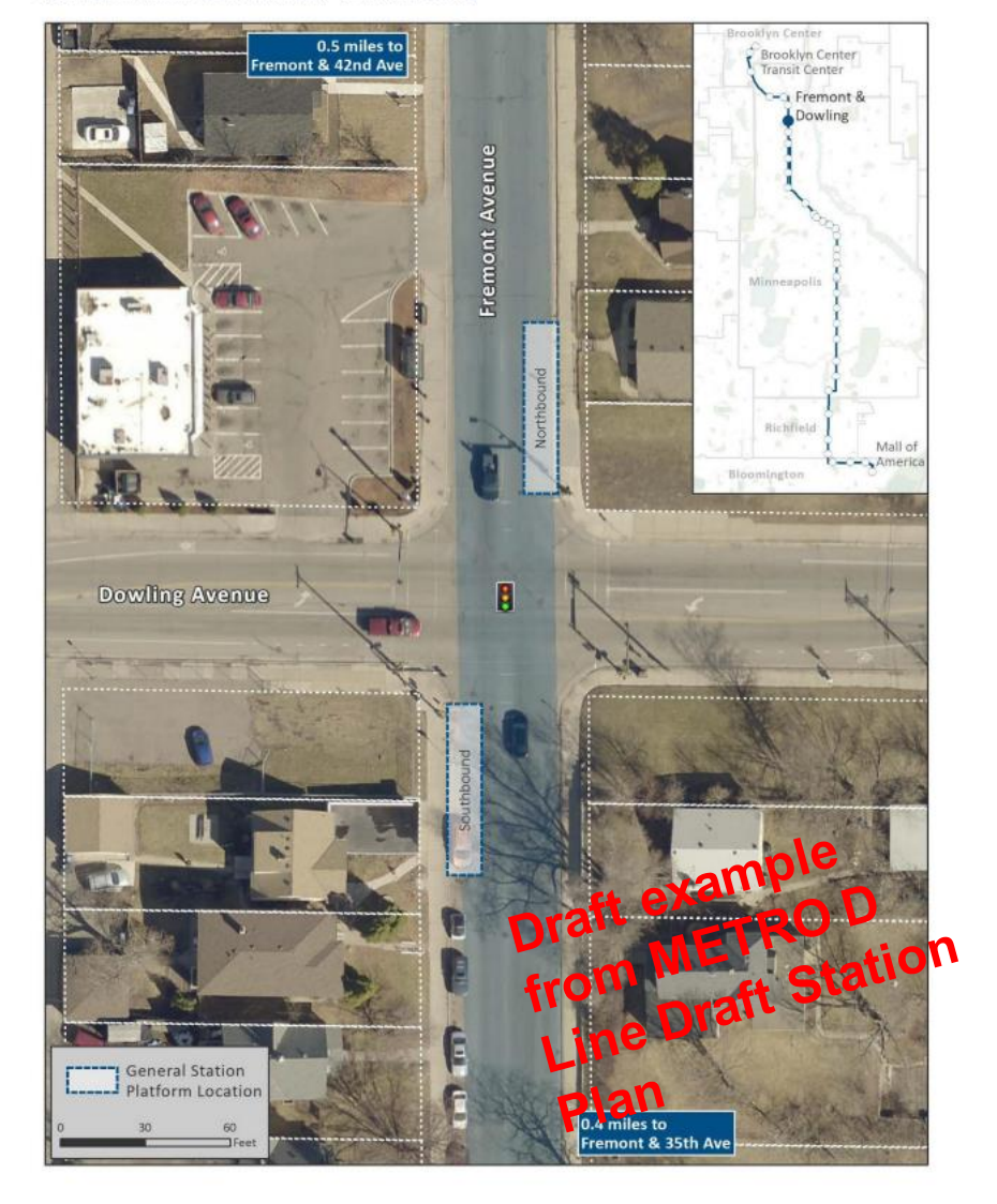
Figure 23: Recommended station location - Fremont & Dowling