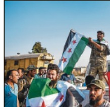
Troops in military uniforms.