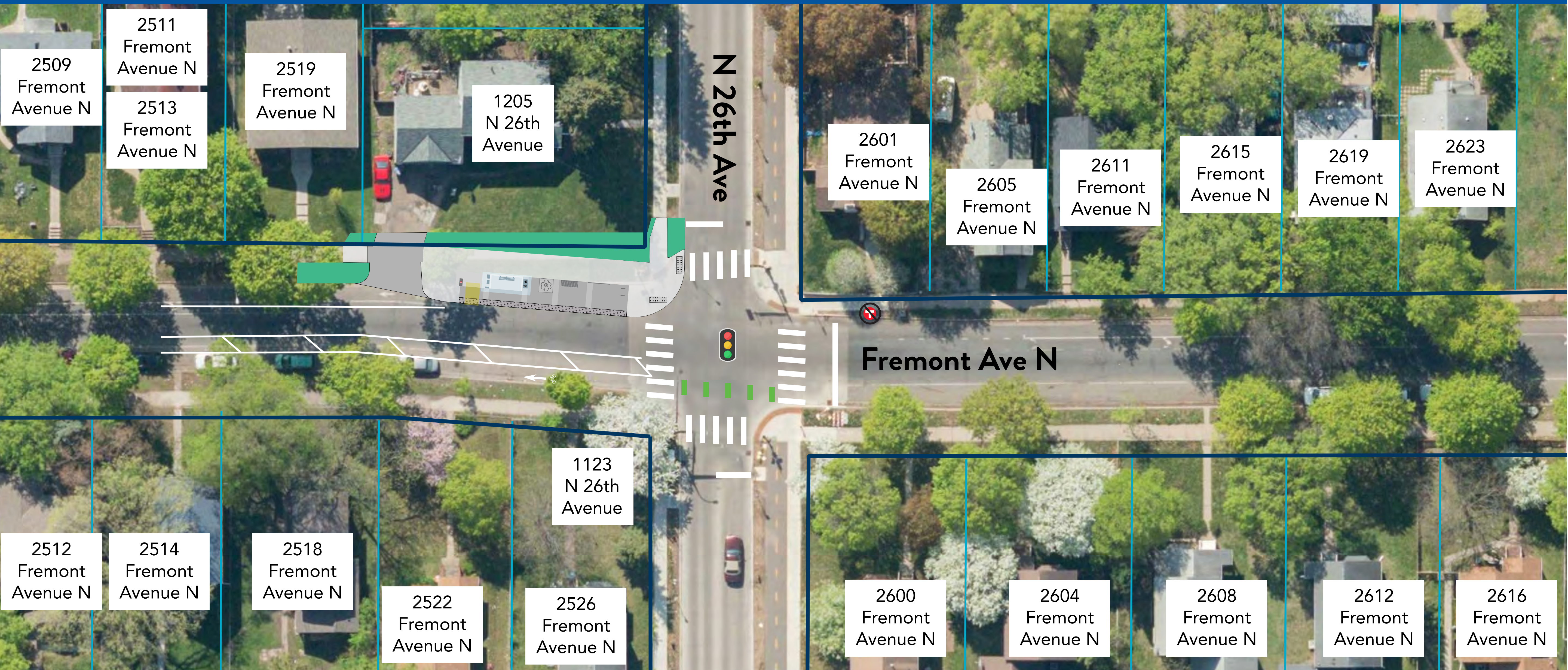
Station Rendering: Northbound Station