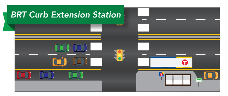
Curb extension provides space for a BRT station and eliminates side-to-side weaving. Far side stops can use signal priority to help the bus keep moving.